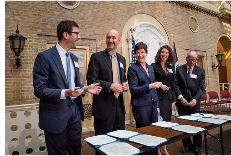
The Biomass

orandum of understanding (MOU) signifying a commitment by the federal government and industry to jointly grow and promote the wood to energy sector.